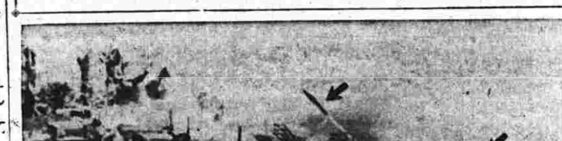
Marine rocket trucks are shown in action in the first photos of new weapon. Arrows indicate barrage aimed at Japs on Saipan. Now improved, these land-based rockets are important weapons on all fronts.